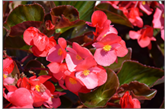
Whopper Rose Bronze Leaf Begonia flowers