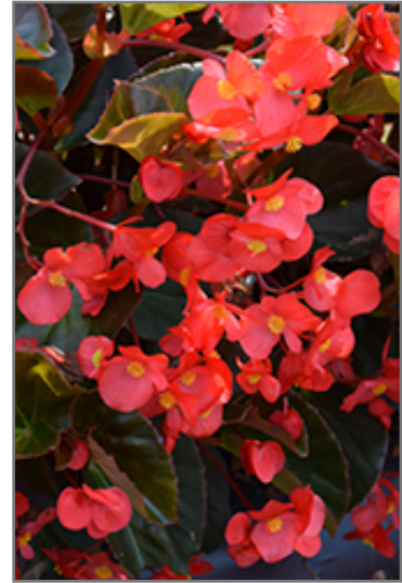
Big Red Bronze Leaf Begonia flowers

Big Red Bronze Leaf Begonia is a fine choice for the garden, but it is also a good selection for planting in outdoor containers and hanging baskets. It is often used as a 'filler' in the 'spiller-thriller-filler' container combination, providing a mass of flowers and foliage against which the larger thriller plants stand out. Note that when growing plants in outdoor containers and baskets, they may require more frequent waterings than they would in the yard or garden.