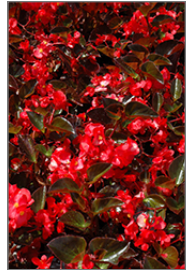
Big Red Bronze Leaf Begonia flowers