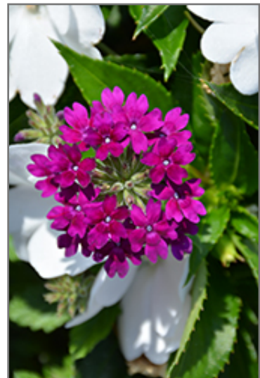
Superbena Royale Plum Wine Verbena flowers