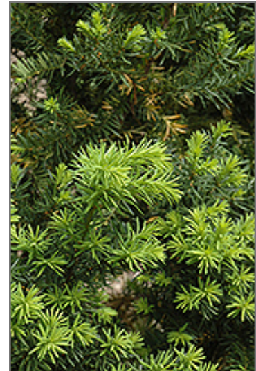
Hicks Yew foliage