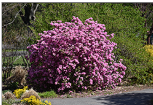
P.J.M. Elite Rhododendron in bloom