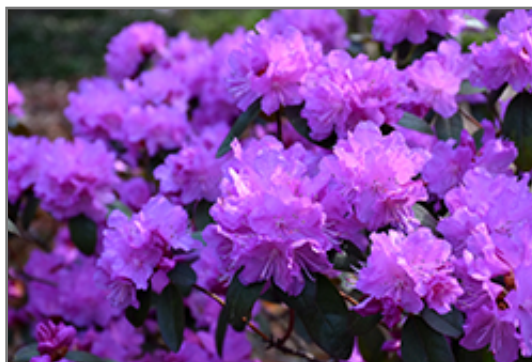
P.J.M. Elite Rhododendron flowers

P.J.M. Elite Rhododendron is recommended for the following landscape applications;