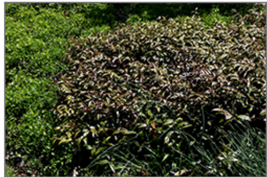
Scarletta Fetterbush