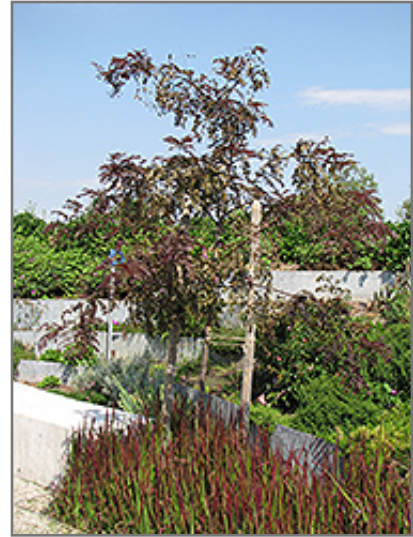
Ruby Lace Honeylocust

* This is a 'special order' plant - contact store for details