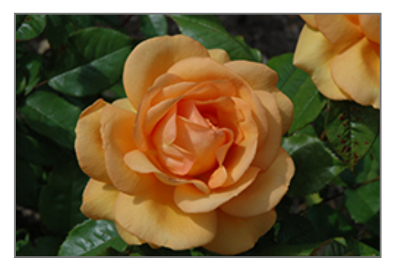
South Africa Sunbelt Rose flowers