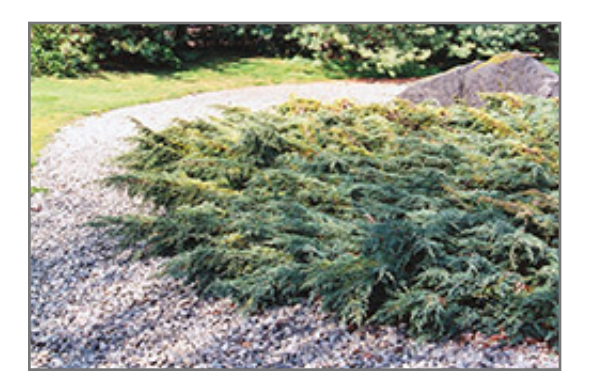
Holger Juniper