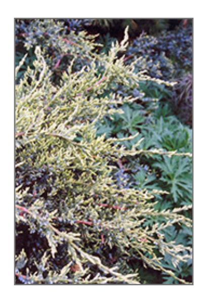
Holger Juniper foliage