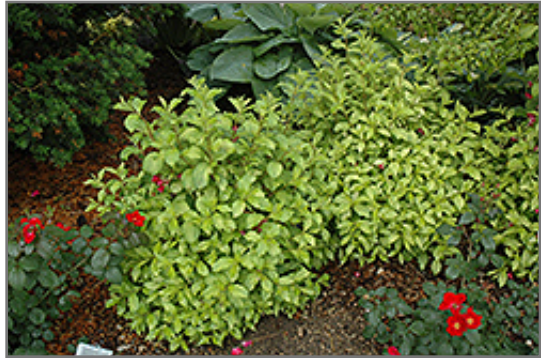
Ghost Weigela

* This is a 'special order' plant - contact store for details