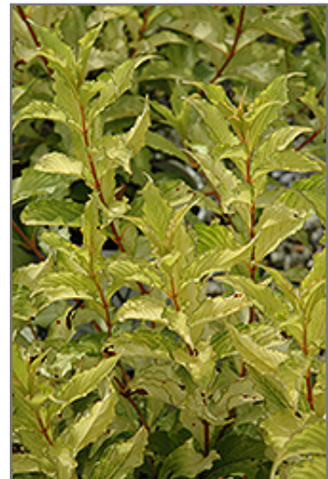
Ghost Weigela foliage