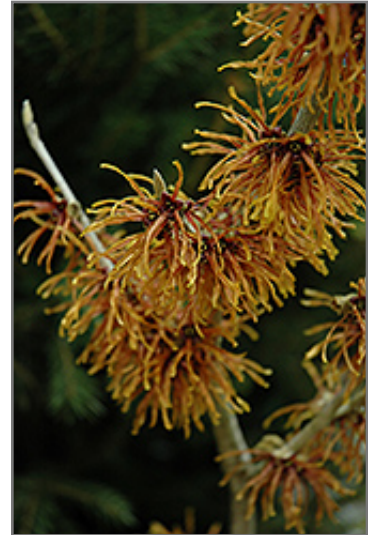
Jelena Witchhazel flowers

Jelena Witchhazel is recommended for the following landscape applications;