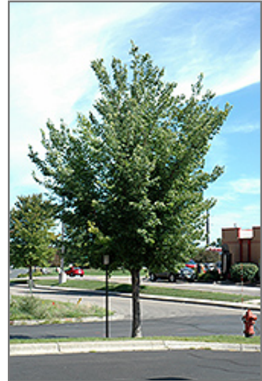
Common Hackberry