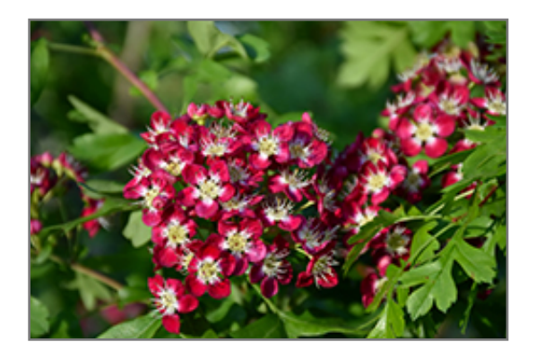
Crimson Cloud English Hawthorn flowers