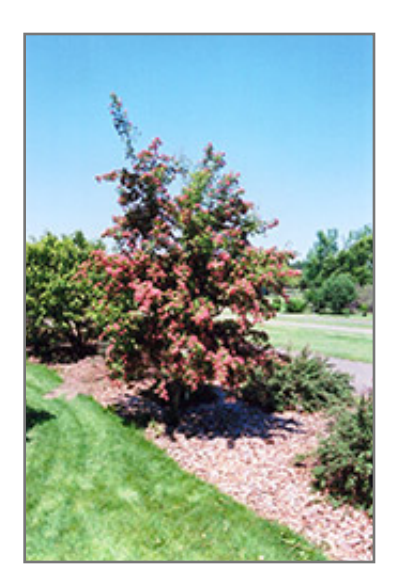
Crimson Cloud English Hawthorn in bloom