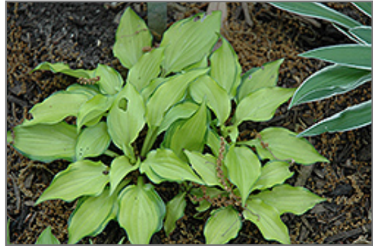
Cracker Crumbs Hosta

Cracker Crumbs Hosta is recommended for the following landscape applications;