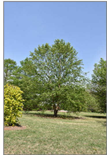
Dura Heat River Birch