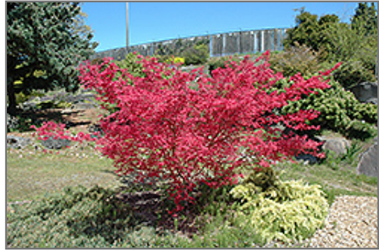
Shindeshojo Japanese Maple in spring

* This is a 'special order' plant - contact store for details