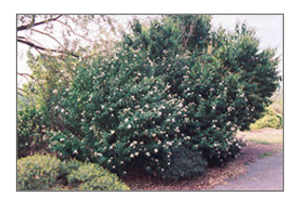
Anemone-Flowered Rose Of Sharon in bloom

Anemone-Flowered Rose Of Sharon is recommended for the following landscape applications;