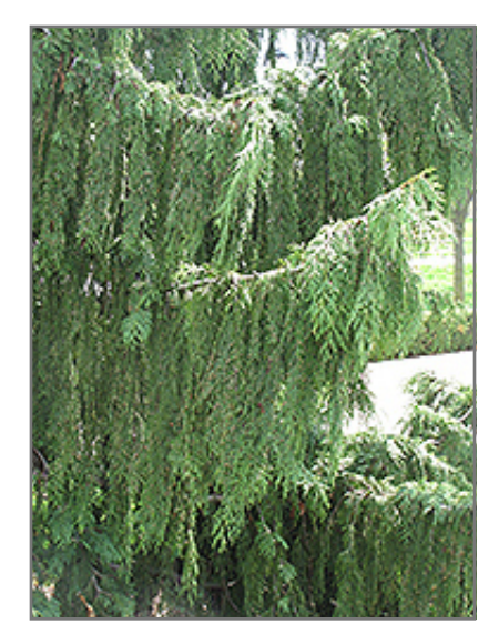
Nootka Cypress foliage