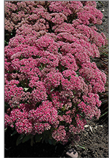
Mr. Goodbud Stonecrop flowers

Mr. Goodbud Stonecrop is recommended for the following landscape applications;