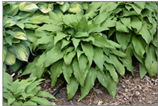
Red October Hosta