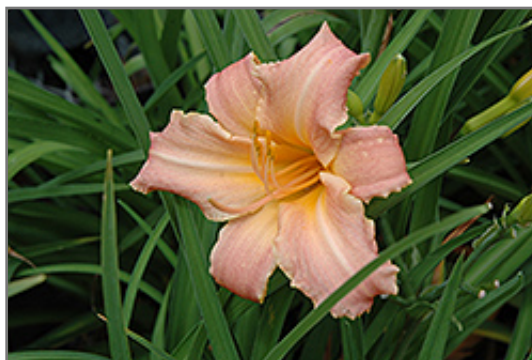
Children's Festival Daylily flowers