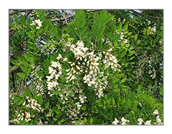
Black Locust flowers