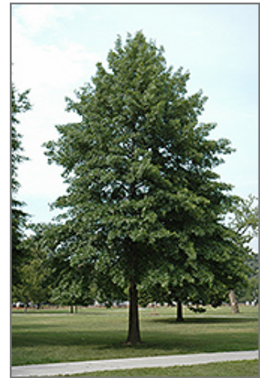
Pin Oak