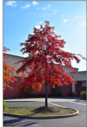
Pin Oak in fall