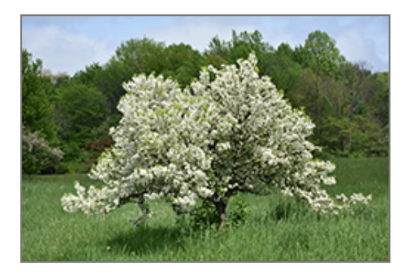
Lollipop Flowering Crab in bloom