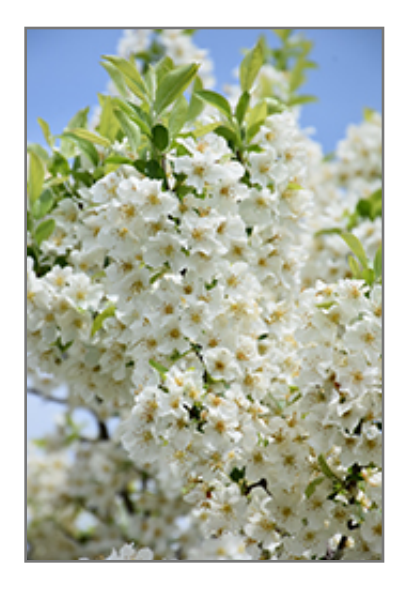
Lollipop Flowering Crab flowers