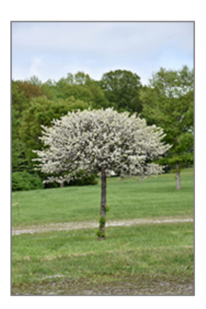
Lollipop Flowering Crab in bloom

* This is a 'special order' plant - contact store for details