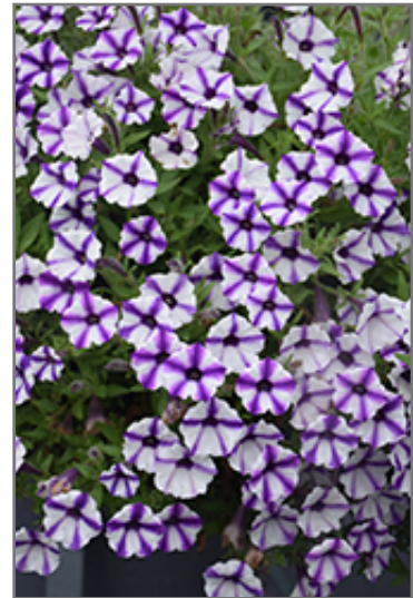
Supertunia Mini Vista Violet Star Petunia flowers

Supertunia Mini Vista Violet Star Petunia is a dense herbaceous annual with a trailing habit of growth, eventually spilling over the edges of hanging baskets and containers. Its medium texture blends into the garden, but can always be balanced by a couple of finer or coarser plants for an effective composition.