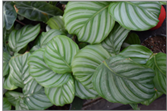
Color Full Orbifolia Prayer Plant foliage