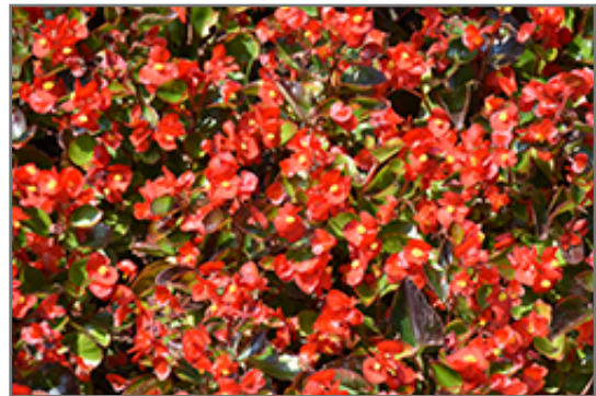
Ambassador Scarlet Begonia flowers