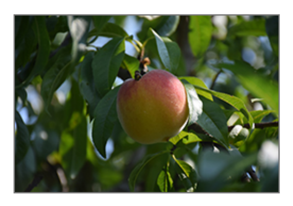
Harrow Diamond Peach fruit