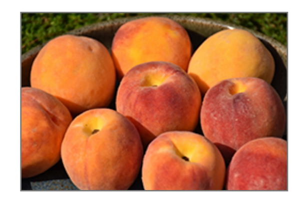
Harrow Diamond Peach fruit

Harrow Diamond Peach is clothed in stunning clusters of fragrant pink flowers along the branches in early spring, which emerge from distinctive rose flower buds before the leaves. It has dark green deciduous foliage. The narrow leaves turn yellow in fall. The fruits are showy yellow drupes with a red blush, which are carried in abundance in mid summer. The fruit can be messy if allowed to drop on the lawn or walkways, and may require occasional clean-up.