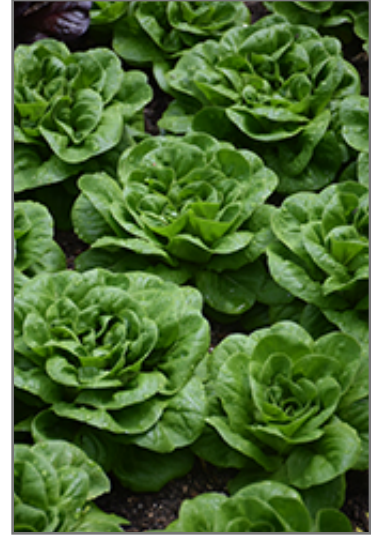
Buttercrunch Lettuce

Buttercrunch Lettuce will grow to be about 12 inches tall at maturity, with a spread of 6 inches. When planted in rows, individual plants should be spaced approximately 8 inches apart. This vegetable plant is an annual, which means that it will grow for one season in your garden and then die after producing a crop. Because of its relatively short time to maturity, it lends itself to a series of successive plantings each staggered by a week or two; this will prolong the effective harvest period.