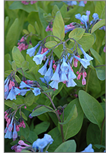
Virginia Bluebells flowers