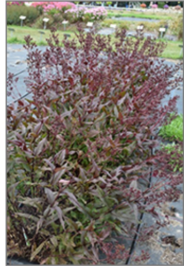
Pocahontas Beard Tongue

This is a relatively low maintenance plant, and is best cleaned up in early spring before it resumes active growth for the season. It is a good choice for attracting butterflies to your yard. It has no significant negative characteristics.