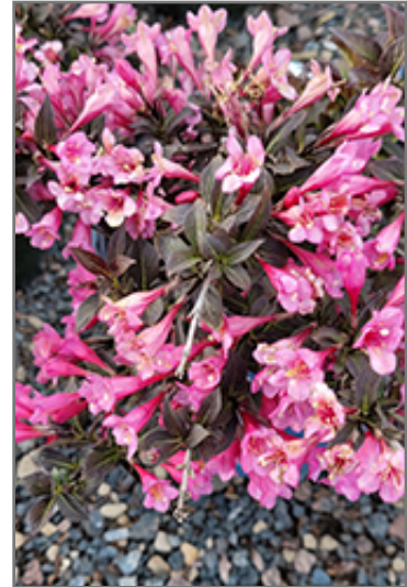
Date Night Stunner Weigela flowers