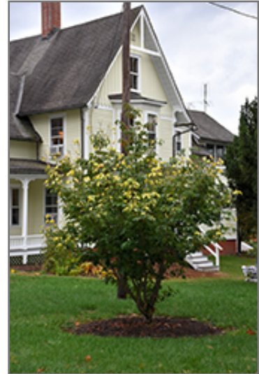
Champion's Gold Chinese Dogwood