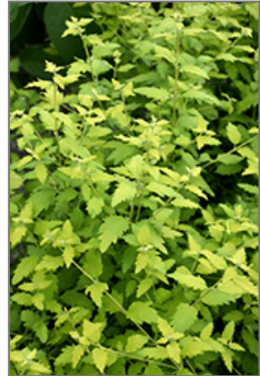
Sunshine Blue II Caryopteris foliage

Sunshine Blue II Caryopteris makes a fine choice for the outdoor landscape, but it is also well-suited for use in outdoor pots and containers. With its upright habit of growth, it is best suited for use as a 'thriller' in the 'spiller-thriller-filler' container combination; plant it near the center of the pot, surrounded by smaller plants and those that spill over the edges. It is even sizeable enough that it can be grown alone in a suitable container. Note that when grown in a container, it may not perform exactly as indicated on the tag - this is to be expected. Also note that when growing plants in outdoor containers and baskets, they may require more frequent waterings than they would in the yard or garden.