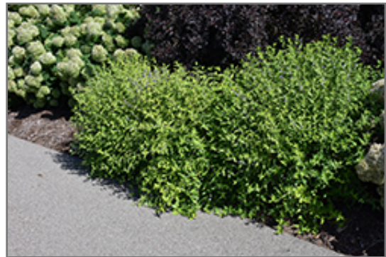
Sunshine Blue II Caryopteris in bloom