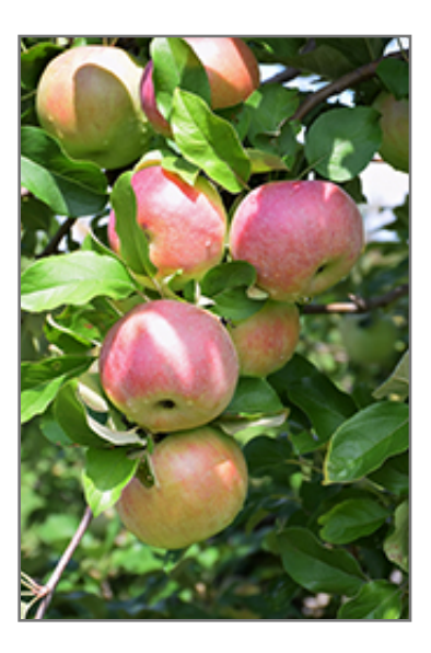
Northern Spy Apple fruit