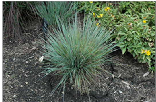
Standing Ovation Bluestem