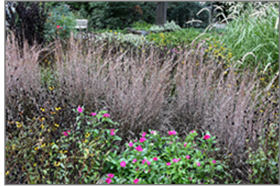
Standing Ovation Bluestem in fall

Standing Ovation Bluestem is recommended for the following landscape applications;