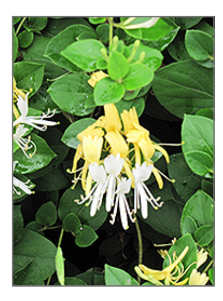
Hall's Japanese Honeysuckle flowers