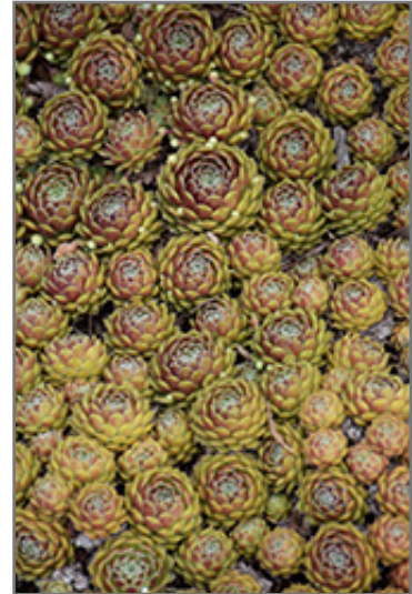
Piloseum Hens And Chicks

Piloseum Hens And Chicks is recommended for the following landscape applications;