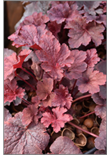
Cajun Fire Coral Bells foliage

Cajun Fire Coral Bells is recommended for the following landscape applications;