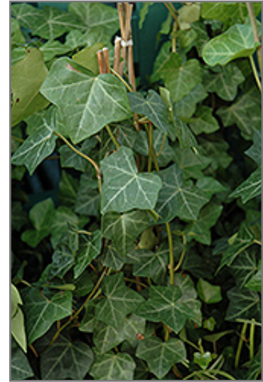
Thorndale Ivy foliage