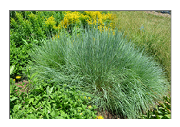
Prairie Blues Bluestem