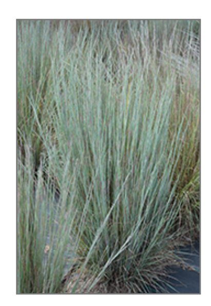
Prairie Blues Bluestem