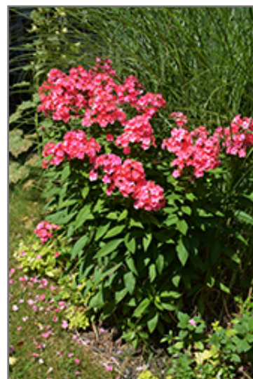
Flame Coral Garden Phlox in bloom