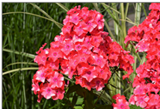
Flame Coral Garden Phlox flowers