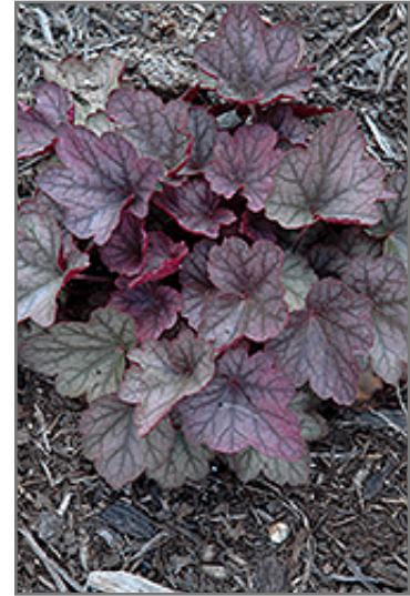
Carnival Rose Granita Coral Bells foliage

Carnival Rose Granita Coral Bells is recommended for the following landscape applications;