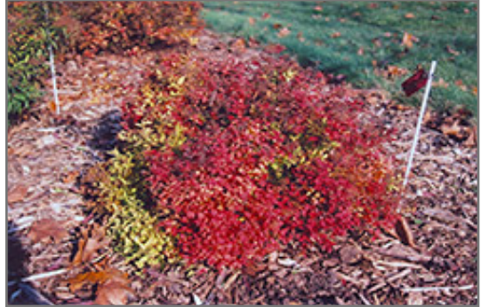
Dakota Goldcharm Spirea in fall

* This is a 'special order' plant - contact store for details