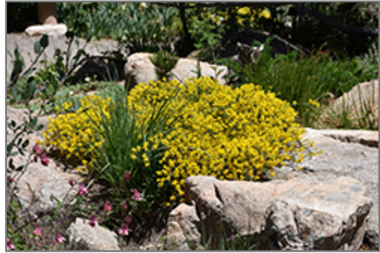
Vancouver Gold Woadwaxen in bloom