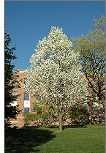
Mountain Frost Pear in bloom

Mountain Frost Pear is recommended for the following landscape applications;