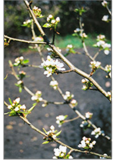
Mountain Frost Pear flowers

* This is a 'special order' plant - contact store for details