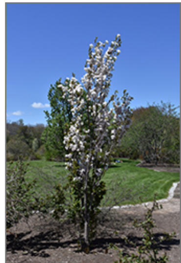
Amanogawa Flowering Cherry in bloom